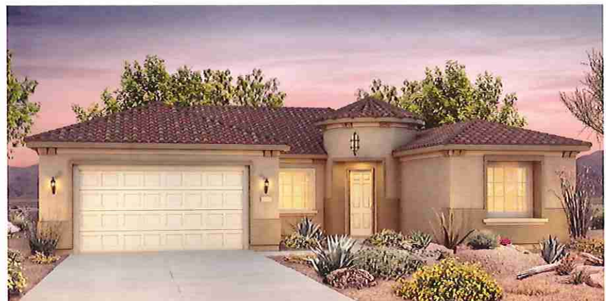
Elevation "B" Italian