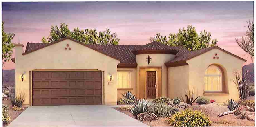
Elevation "A" Spanish