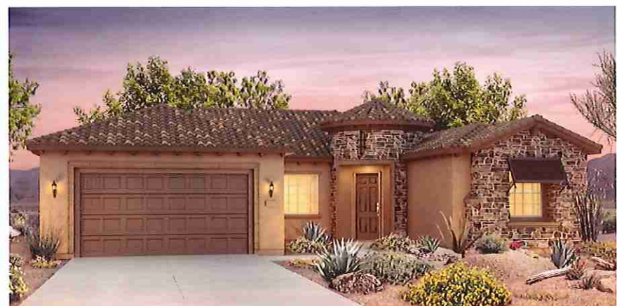
Elevation "C" Tuscan