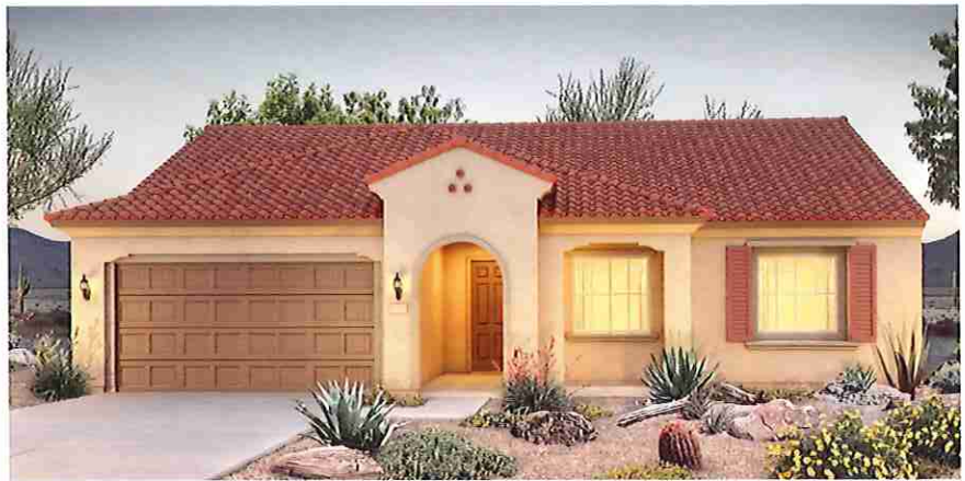
Elevation "A" Spanish