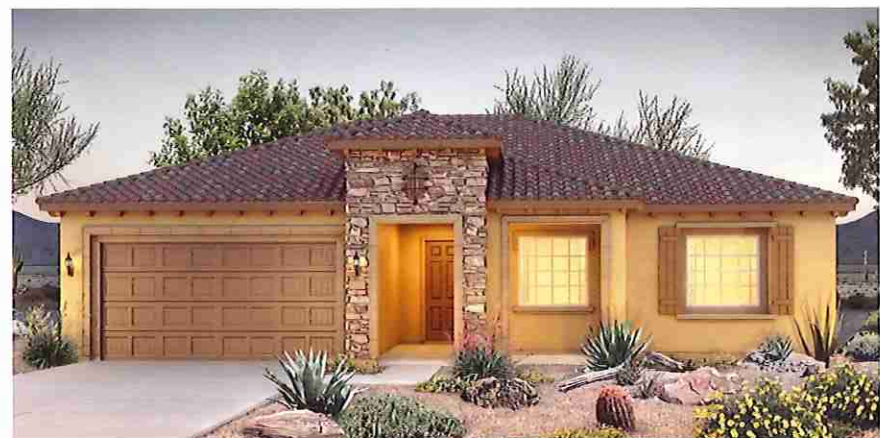
Elevation "C" Tuscan