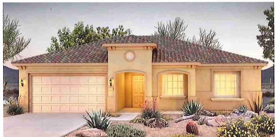
Elevation "B" Italian