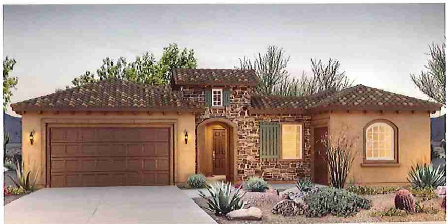
Elevation "C" Tuscan