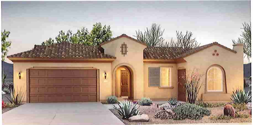
Elevation "A" Spanish