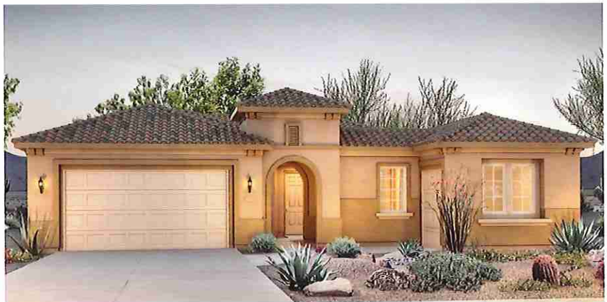
Elevation "B" Italian