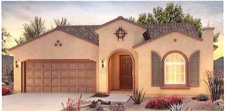
Elevation "A" Spanish