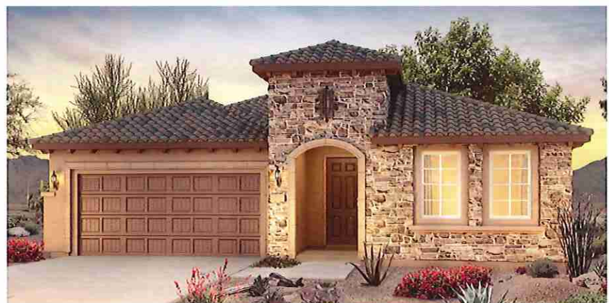
Elevation "C" Tuscan