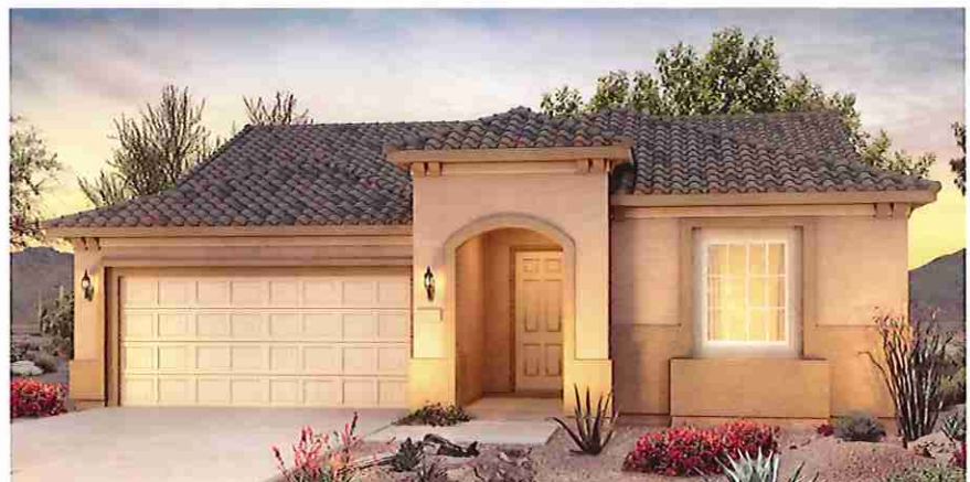
Elevation "B" Italian